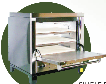
SINGLE DECK ELECTRIC OVEN