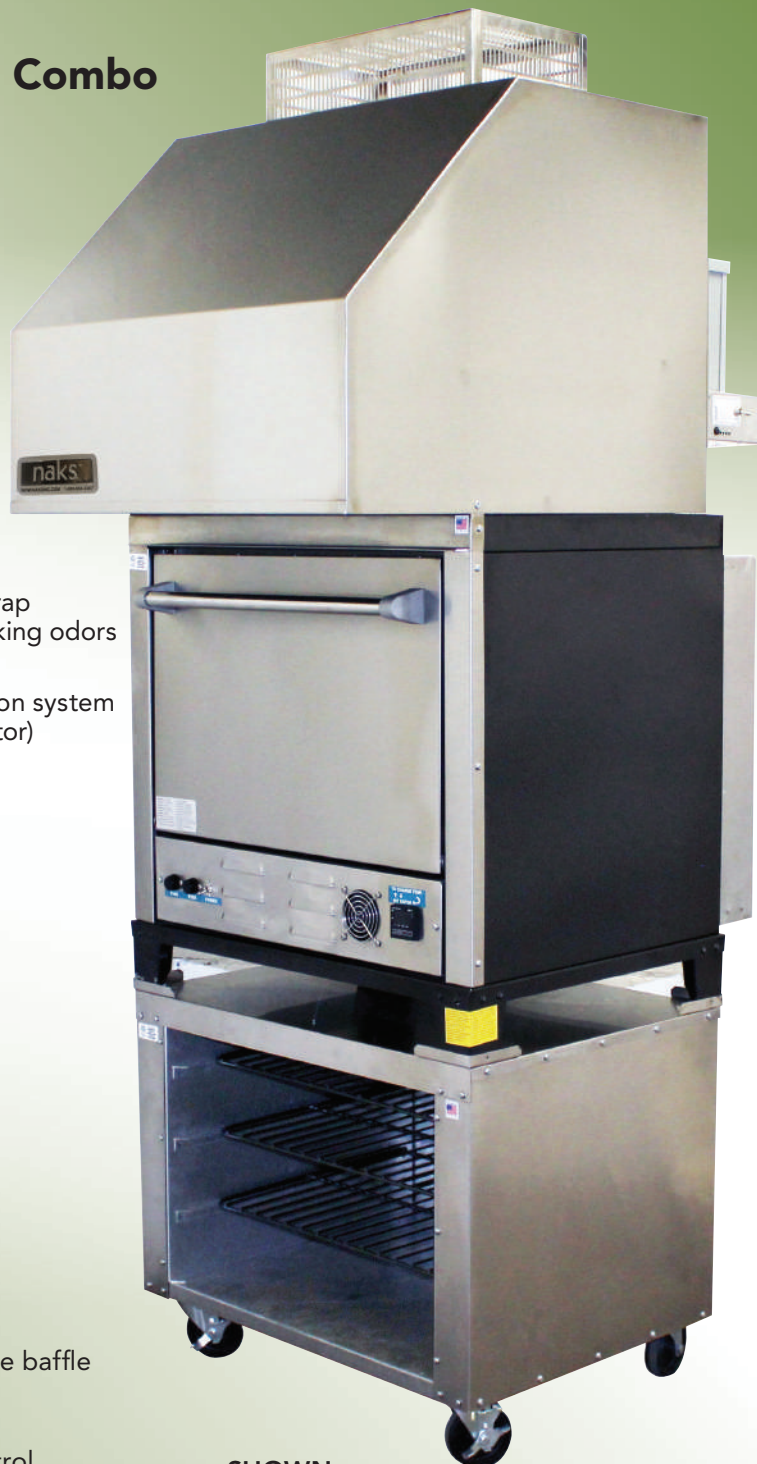
SHOWN VH-30 Ventless Hood/Oven Combo with optional stand*