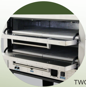
TWO DECK ELECTRIC OVEN DOORS OPEN