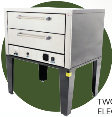
TWO DECK ELECTRIC OVEN