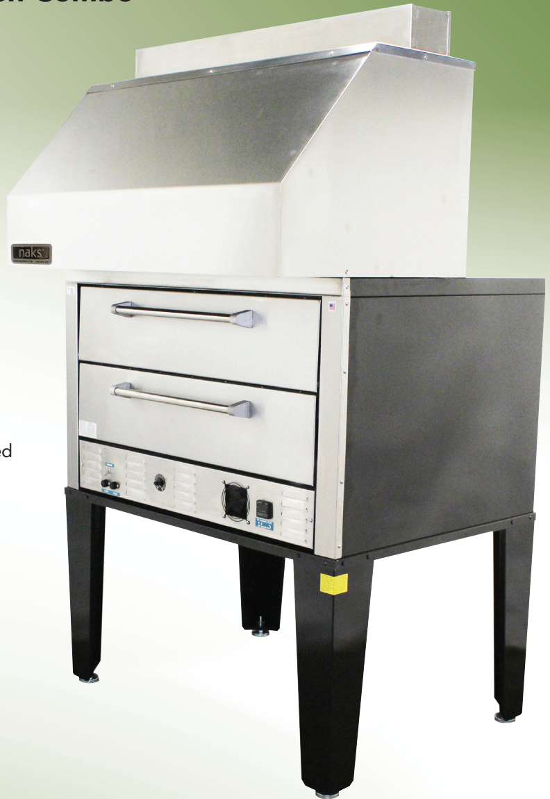
SHOWN VH-50 Ventless Hood/Oven Combo